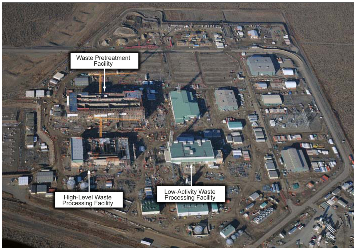
Figure 2: WTP Construction Site as of March 2012