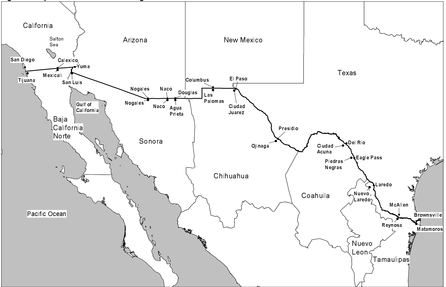
Figure 1: Map of u.s.-Mexican Border Region