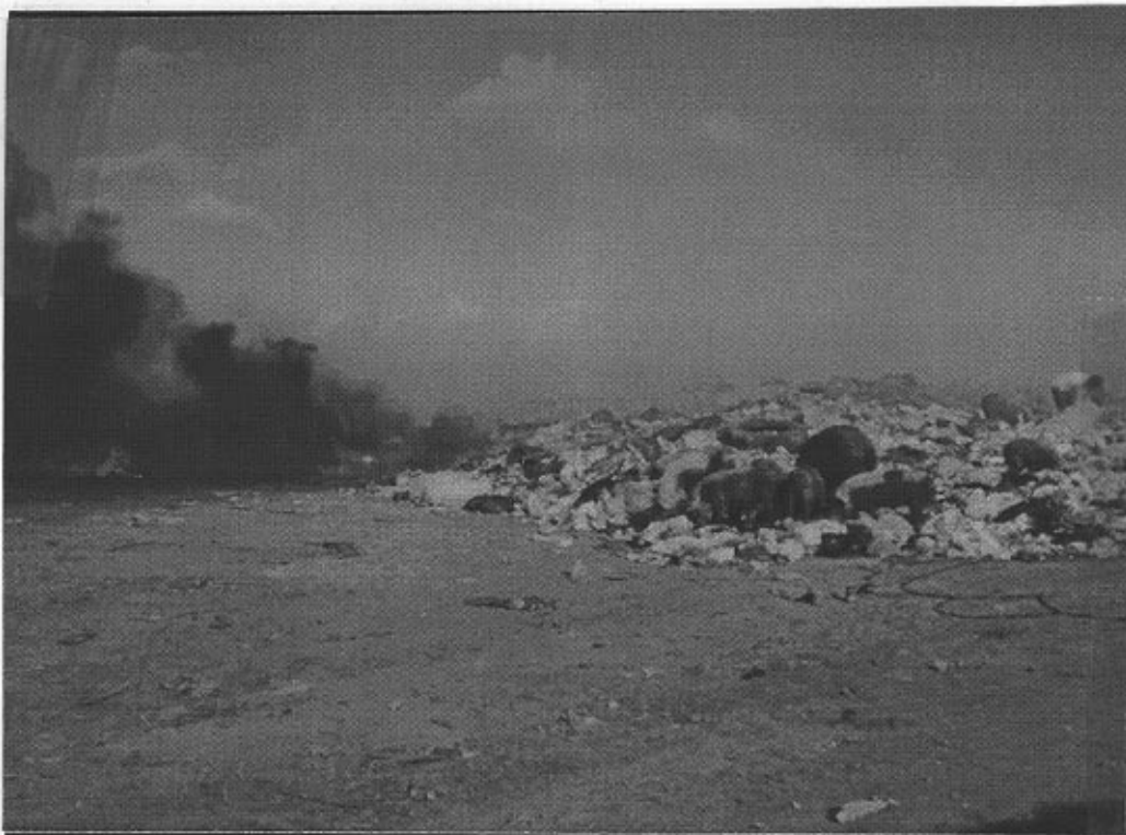
Open incineration of waste produces smoke that impairs the area's air quality.