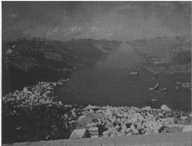
Raw sewage flowing in an open canal poses a health threat to area residents.