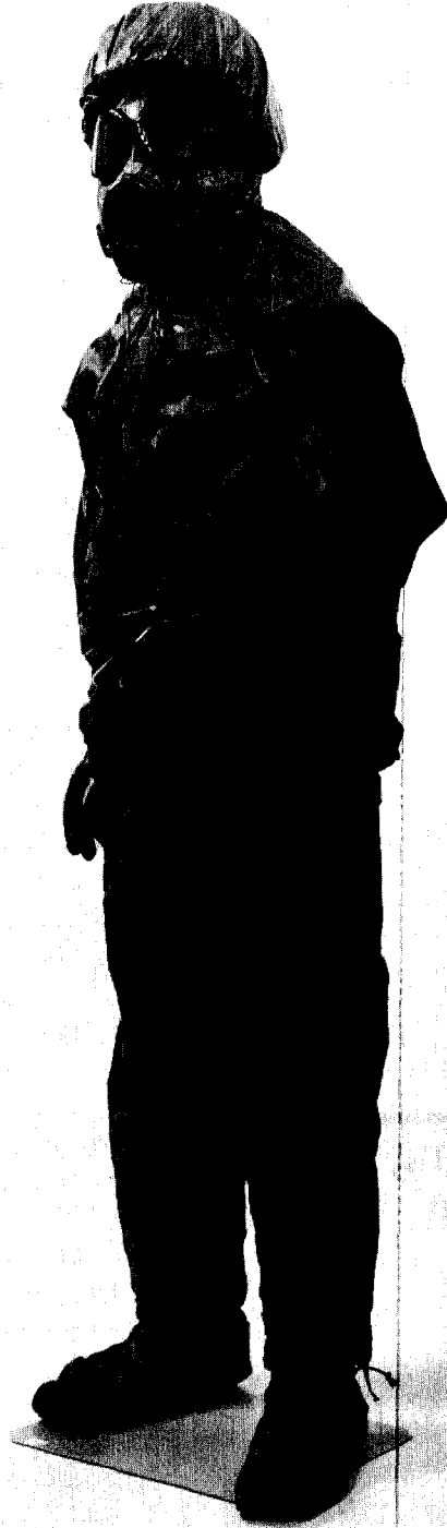
Figure 2.1: Soldier in Full Chemical Protective Gear