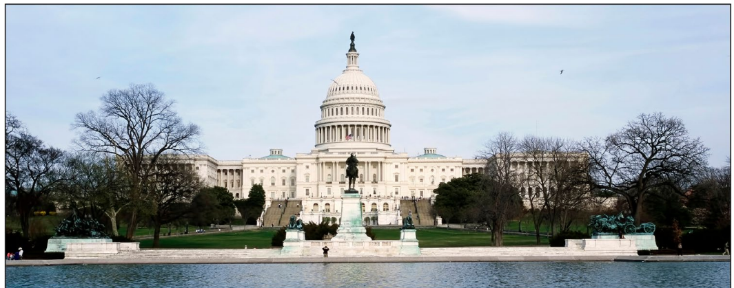
Figure 1: U.S. Capitol Building, where the U.S. House of Representatives Assembles

GAO-25-107428