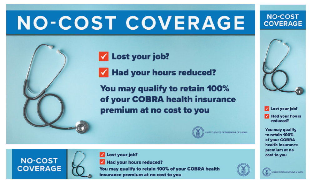
Figure 3: Example of Advertisement Used in EBSA's Consolidated Omnibus Budget Reconciliation Act of 1985 (COBRA) Subsidy Marketing Campaign During the Pandemic

GAO-25-107055