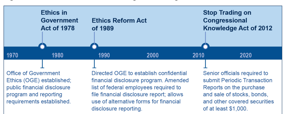
Figure 3: Timeline of Federal Ethics Legislative Program Reforms

Since 1978, certain aspects of the financial disclosure program established by the EIGA have been amended and modified (see fig. 3). For example, one amendment authorized each supervising ethics office to establish a confidential financial disclosure system. The confidential system is discussed in more detail below.