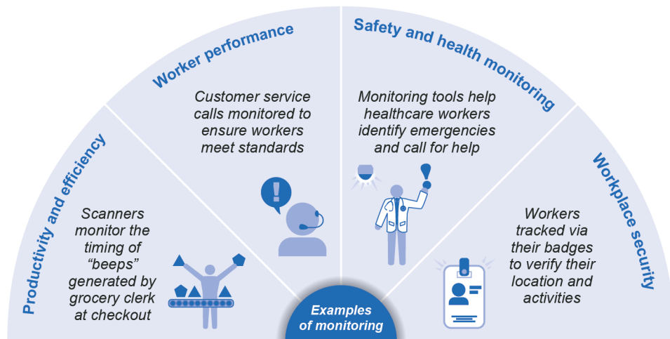
Figure 2: Example Uses of Digital Surveillance

Source: GAO analysis of public comments submitted to the White House Office of Science and Technology Policy; GAO (icons). | GAO-24-107639