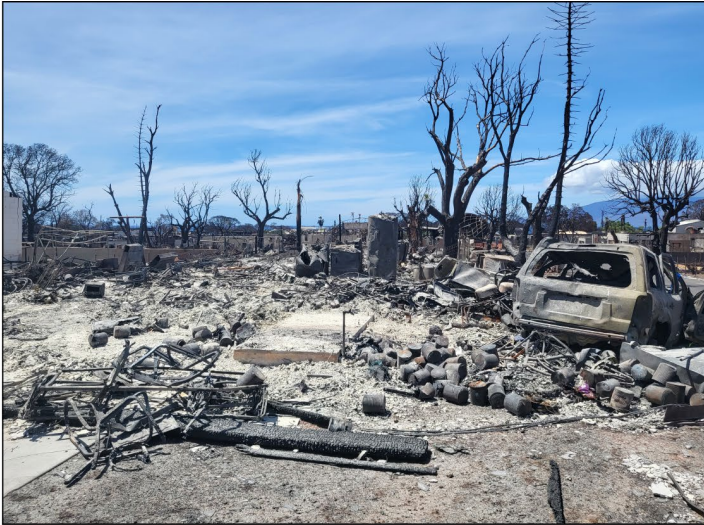
Figure 1: Examples of Residential Wildfire Debris, Lahaina, Hawaii, September 2023