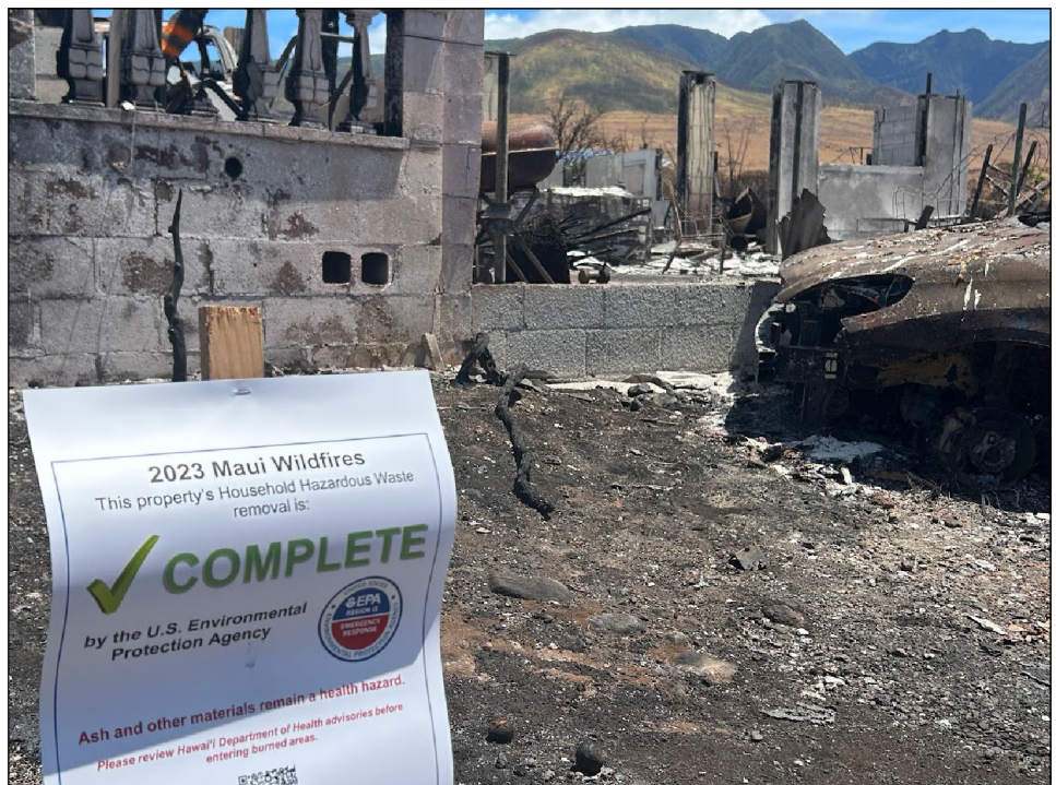
Figure 2: Environmental Protection Agency Environmental Assessment Sign at Residential Property, Lahaina, Hawaii, September 2023

above. As previously described, this includes ensuring the property is clear of hazardous materials, as seen in figure 2. The contaminated ground that wildfires leave behind further limits the available sites to place temporary housing or manufactured housing units. This is particularly challenging in communities lacking ample rental properties outside the footprint of the wildfire.