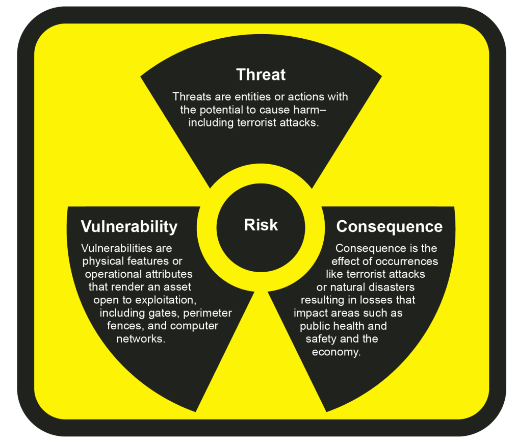
Figure 1: The Three Elements of Radioactive Material Risk

Source: GAO analysis of Department of Homeland Security information. | GAO-24-107014