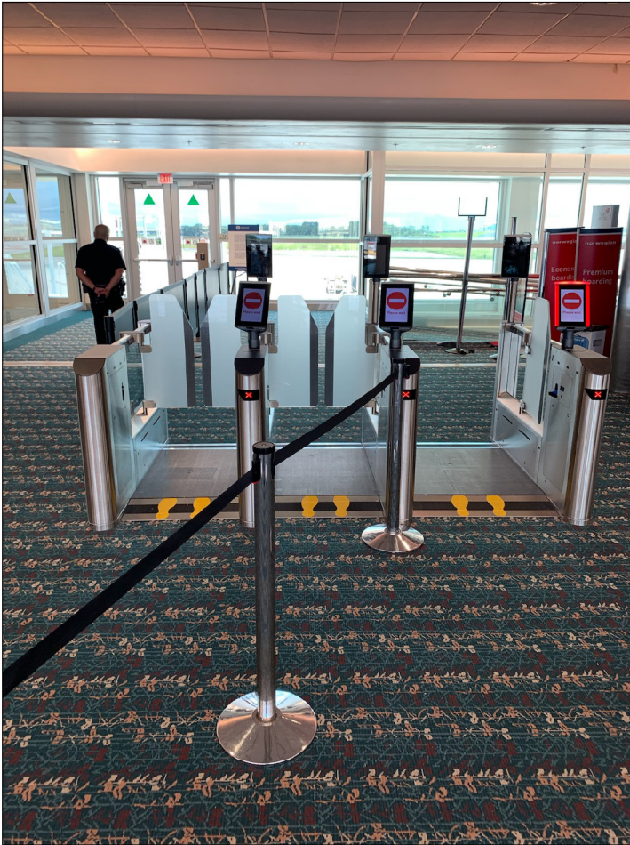
Figure 1: Examples of Cameras Used for Air Exit Facial Recognition