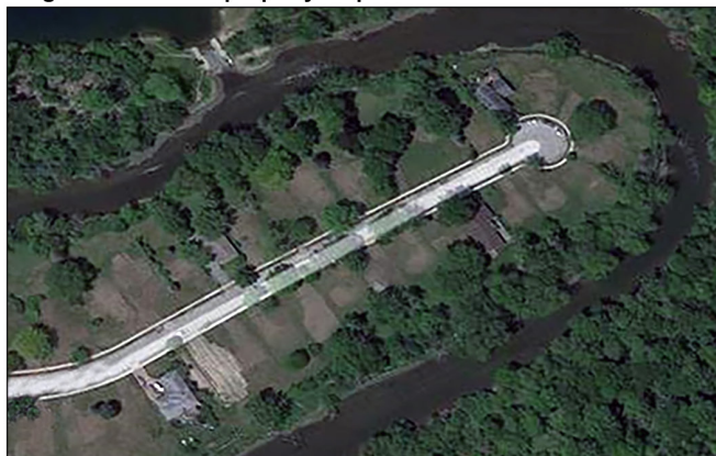
Neighborhood after property acquisitions

The City of Des Plaines received FEMA grants in 2015 and 2019 to acquire and demolish about 25 homes. The city maintains services and utilities for the remaining homes in the neighborhood.