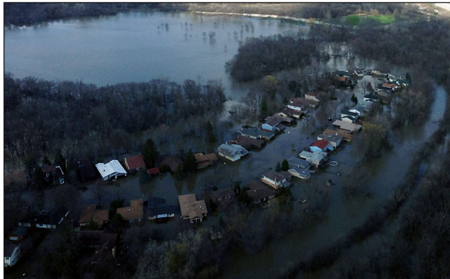
Neighborhood during 2013 flood

In April 2013, the neighborhood suffered severe flooding.