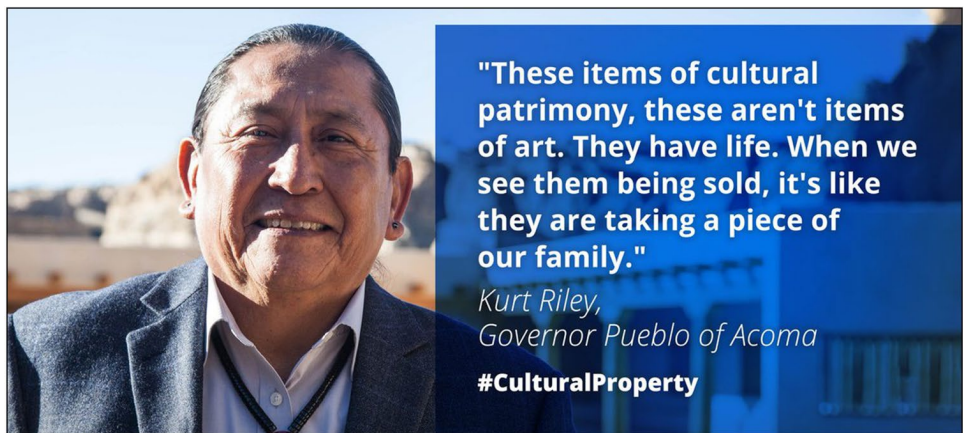
Image from a Department of State Social Media Campaign to Raise Awareness about Protecting Native American Cultural Items

GAO-22-105685