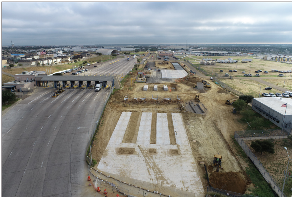
Figure 3: CBP's Donations Acceptance Program Partnership to Facilitate Commercial Truck Processing in Laredo, Texas

Source: U.S. Customs and Border Protection (CBP). | GAO-22-105421