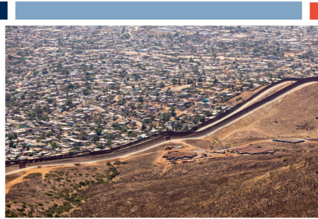
Border Wall System Program