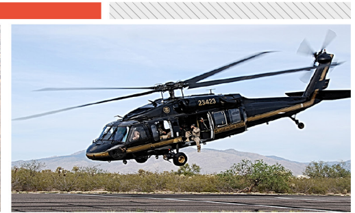
Medium Lift Helicopter

GAO-22-104684