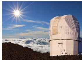
Daniel K. Inouye Solar Telescope