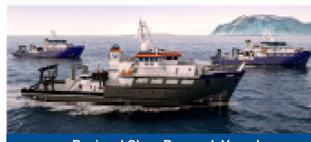
Regional Class Research Vessels