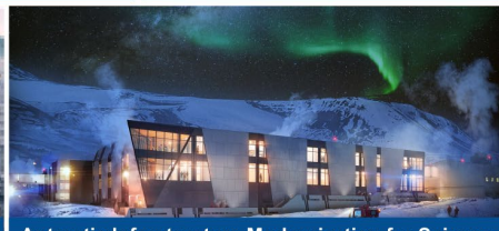
Antarctic Infrastructure Modernization for Science

GAO-21-417