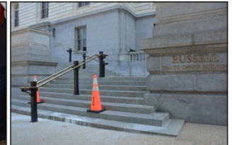
Repairs to the steps of a Senate office building.