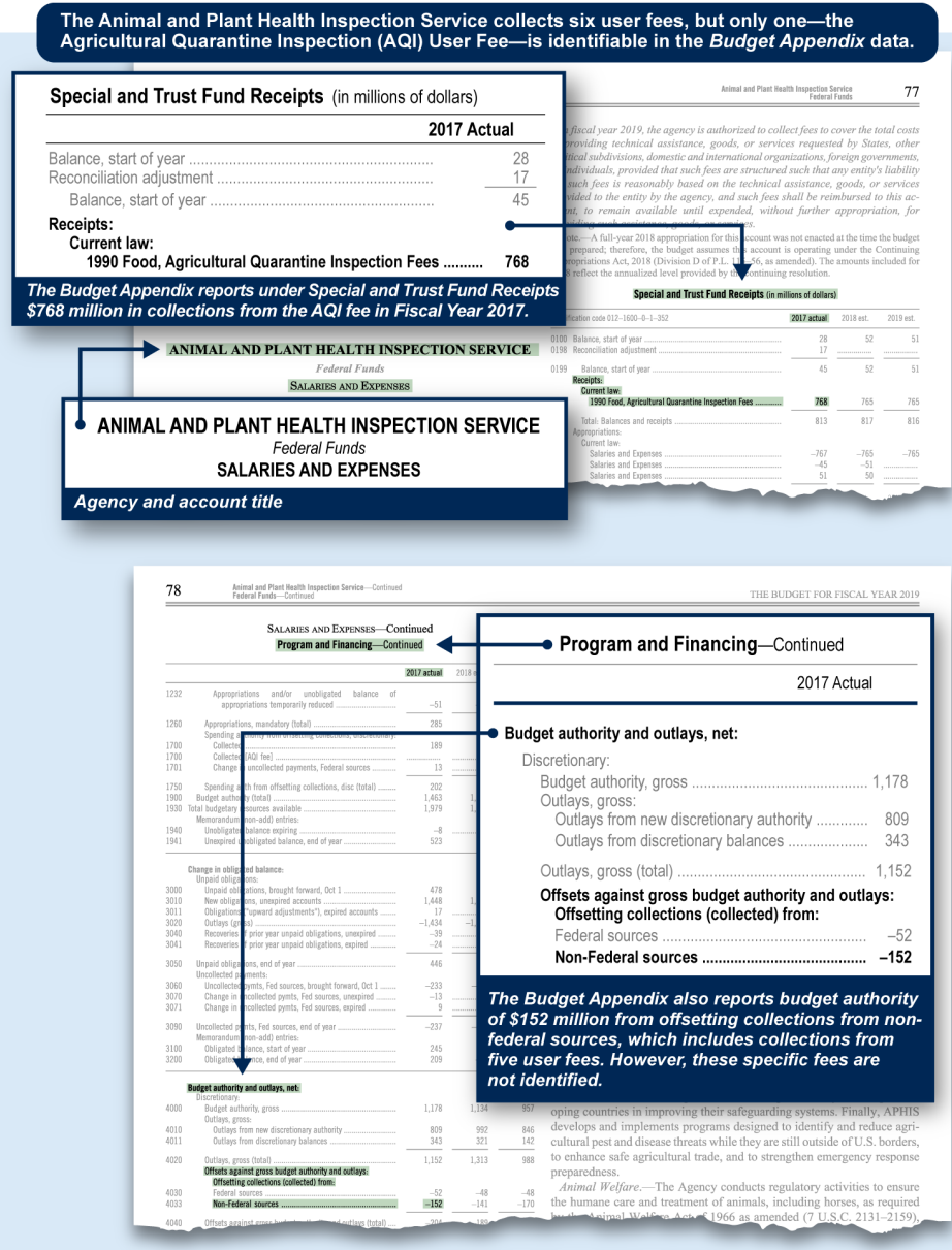
Figure 3: The Budget Appendix Reporting of Fee Collections by the Animal and Plant Health Inspection Service