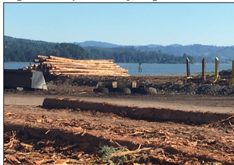
Logs at an Export Facility; Logs on a Truck