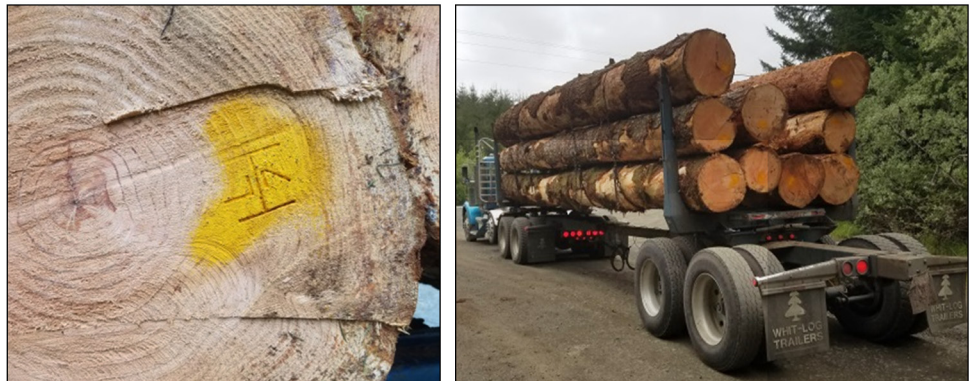
Figure 2. Federal Logs Marked With Yellow Paint and Hammer Brands

GAO-18-593