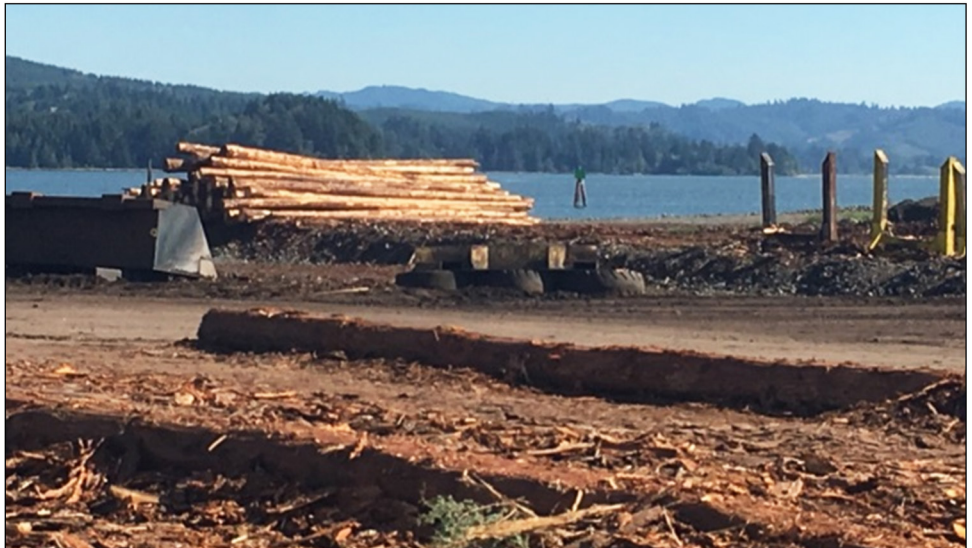
Figure 3: Unprocessed Logs at an Export Facility