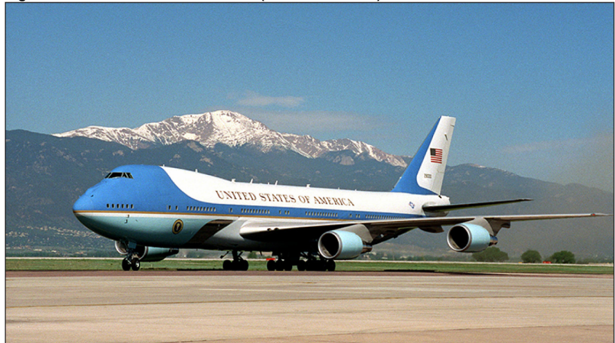
Figure 1: The U.S. Air Force VC-25A ("Air Force One")

a Other related expenses includes commercial airfares.