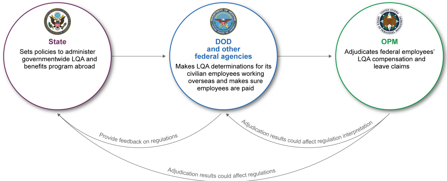
Figure 1: Department of State (State), Office of Personnel Management (OPM), and Department of Defense (DOD) Roles and Responsibilities for Living Quarters Allowance (LQA)

GAO-15-511