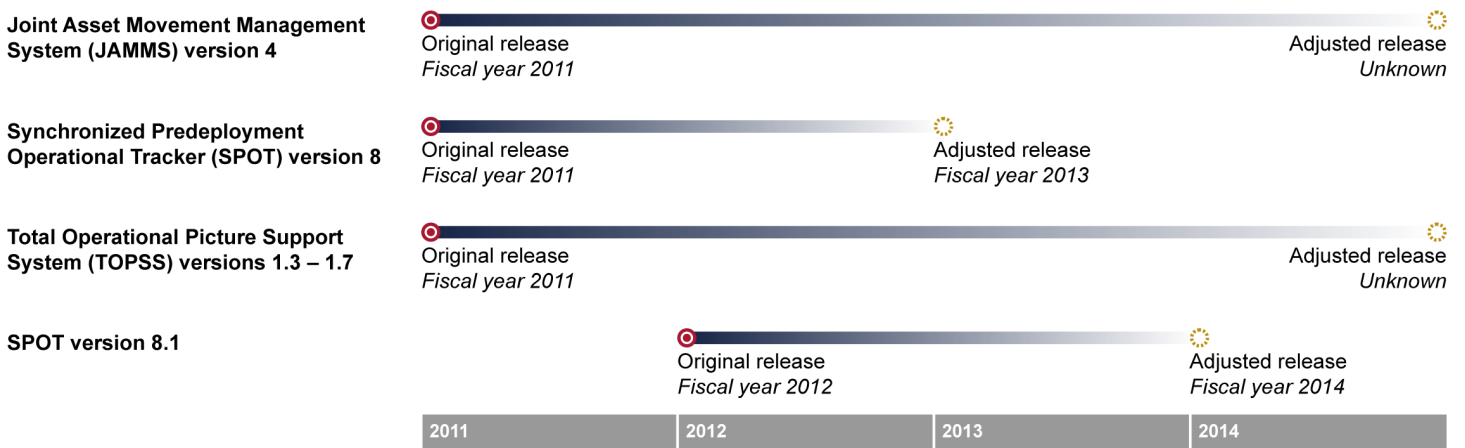
Figure 2: Synchronized Predeployment and Operational Tracker–Enterprise Suite (SPOT-ES) Schedule Delays

Source: GAO analysis of Department of Defense (DOD) information. | GAO-15-250