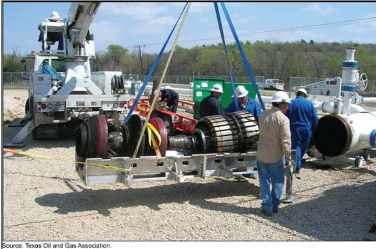
Figure 2: Example of In-Line Inspection Equipment to Detect and Record Pipeline Anomalies

In developing integrity management requirements for distribution pipelines, PHMSA did not prescribe the same types of assessments as it did for its transmission pipelines, because the assessments would often not be practicable for distribution pipelines. For example: