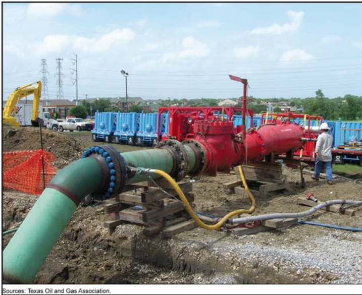
Figure 1: Hydrostatic Testing Equipment Used to Test Pipeline Integrity

line inspection, 18 hydrostatic pressure testing, 19 or direct assessment. 20 Both in-line inspection and hydrostatic testing involve tools or techniques applied inside the pipeline, while direct assessment tools and techniques are applied externally. These assessment methods allow operators to detect specific anomalies 21 in the pipeline, such as imperfections in the pipe wall or weld, that could lead to failure. (See fig. 1 for an example of the equipment used for hydrostatic testing and fig. 2 for an example of the equipment involved in in-line inspections.)