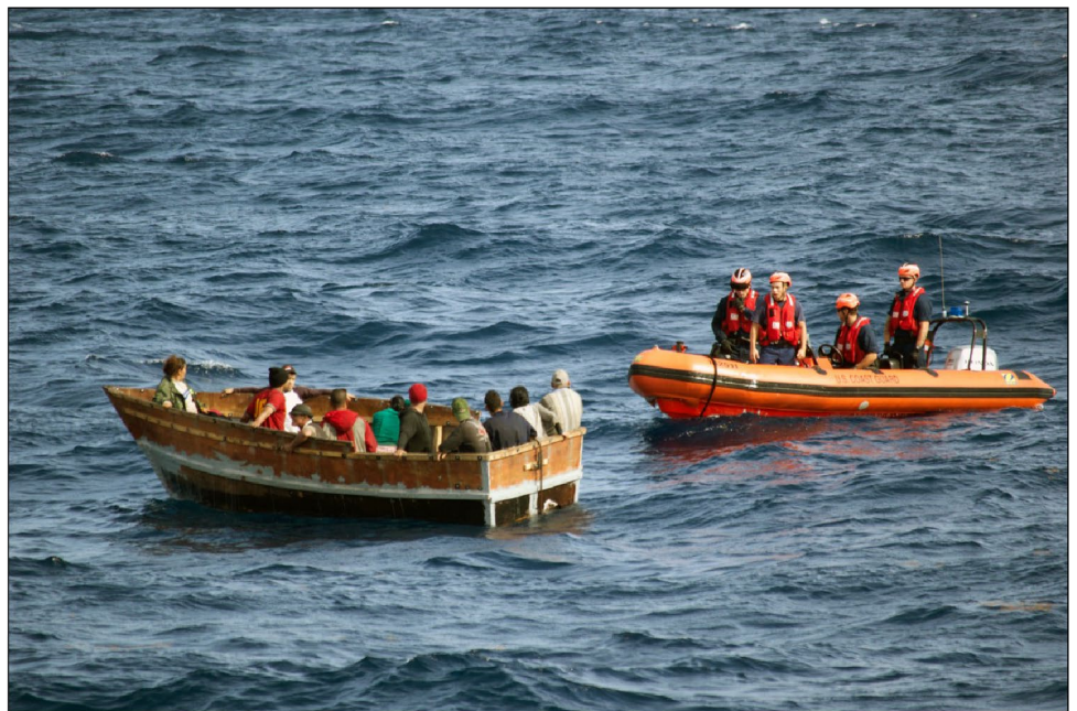
Figure 2: Coast Guard Personnel Conducting a Migrant Interdiction Operation

Source: U.S. Coast Guard. | GAO-24-107144