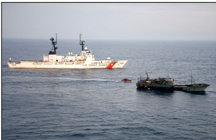
Figure 3: Coast Guard Vessel Interdicting Illegal Fishing and Officials Preparing to Conduct a Law Enforcement Boarding

plastics and other marine debris. IUU fishing encompasses many illicit activities, including under-reporting the number of fish caught and using prohibited fishing gear. In fiscal year 2022, the Coast Guard boarded 81 foreign vessels to suppress IUU fishing, according to the Coast Guard's fiscal year 2024 posture statement. Figure 3 below shows a Coast Guard vessel interdicting a vessel using an illegal high seas driftnet, and Coast Guard officials preparing to conduct a law enforcement boarding. According to the Coast Guard IUU Strategic Outlook, IUU fishing has replaced piracy as the leading global maritime security threat that if unchecked could threaten geo-political stability around the world. 7