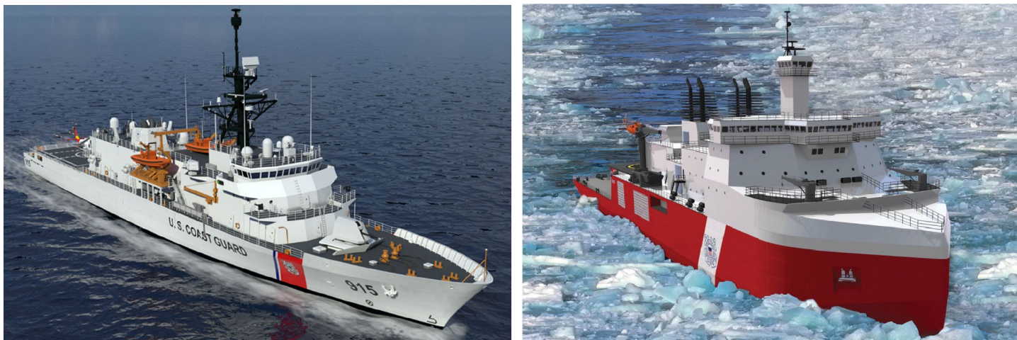
Figure 5: Rendering of the Coast Guard’s Offshore Patrol Cutter (left) and Polar Security Cutter (right)

Source: 2016 Eastern Shipbuilding Group, Panama City, Florida (left image); Bollinger Mississippi Shipbuilding (right image). | GAO-24-107144