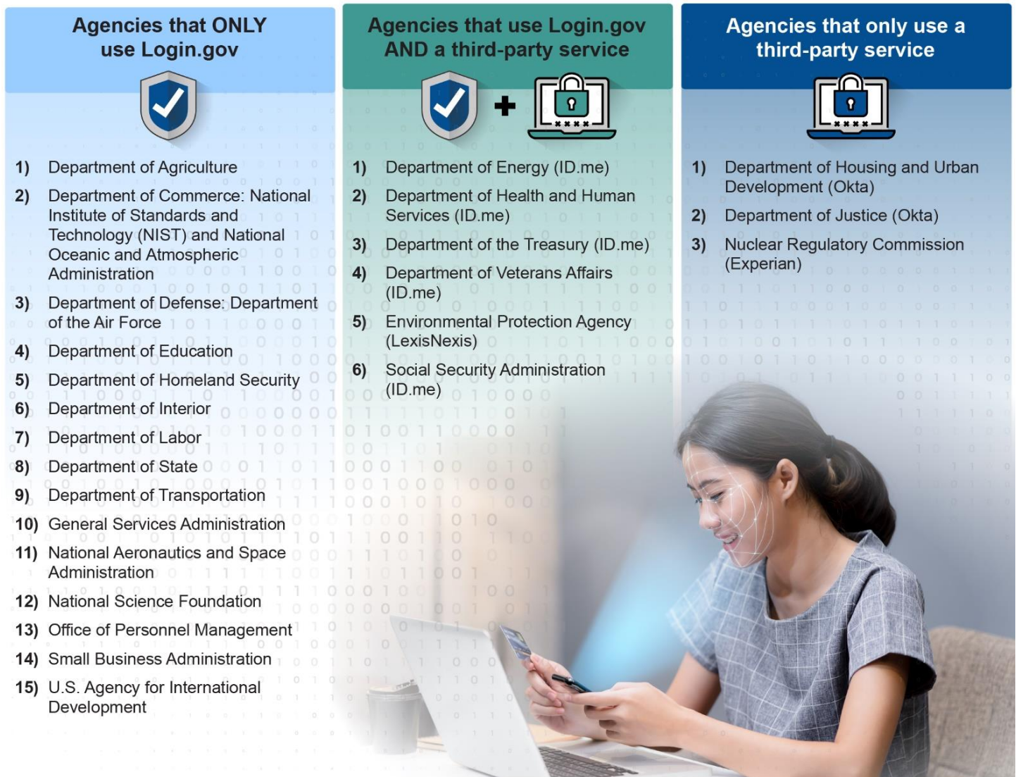
Figure 2: Agencies' Reported Use of Login.gov and Other Commercial Solutions for Public-Facing Applications

GAO-25-106640