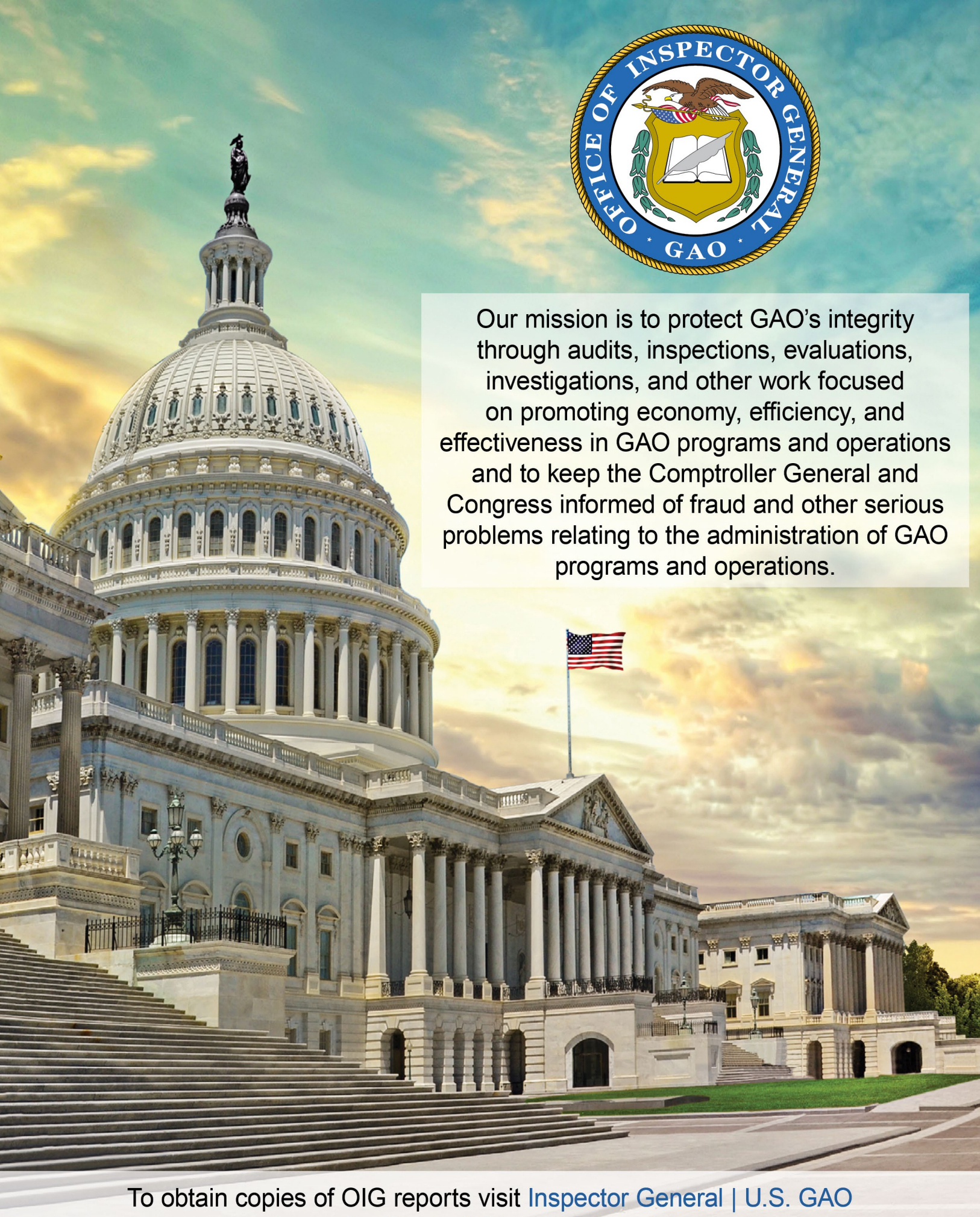
or Inspector General Reports | Oversight.gov