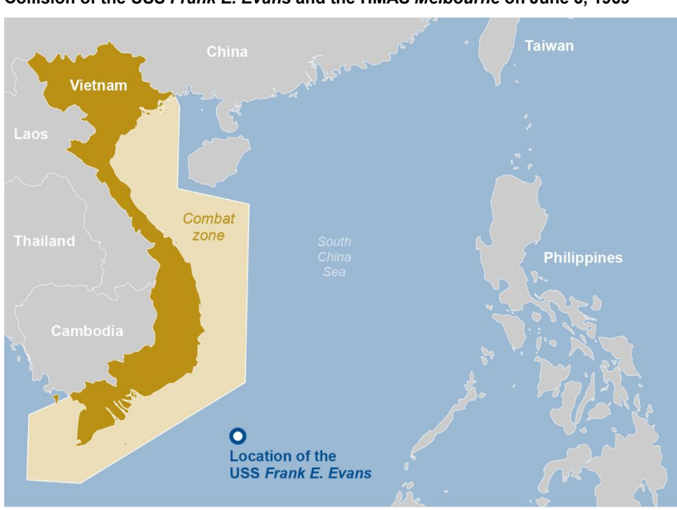
Figure 4: Vietnam Combat Zone Defined in Executive Order 11216 and Location of the Collision of the USS Frank E. Evans and the HMAS Melbourne on June 3, 1969

on at least six occasions, based on our review of DOD documentation. DOD has consistently determined that the circumstances of the collision that killed 74 members of the crew on June 3, 1969, do not meet the criteria for addition to the Wall set forth in DOD Instruction 1300.18. Additionally, DOD has specified that the collision occurred while the ship was engaged in a joint exercise with U.S. and allied ships, but it was not providing direct support to or en route to a combat mission.