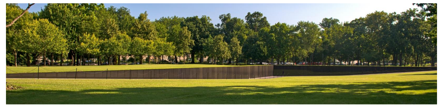
Figure 1: View of the Vietnam Veterans Memorial Wall on the National Mall in Washington, D.C.

GAO-24-107080