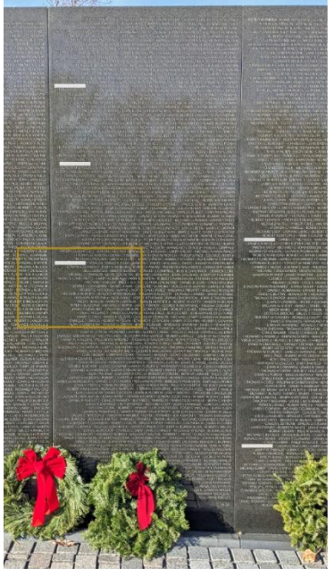
Figure 3: Notional Examples of Potential Space Where Names Could Be Added to the Vietnam Veterans Memorial Wall

Figure 3 illustrates notional examples of where names might be placed in the ragged edge of each panel.