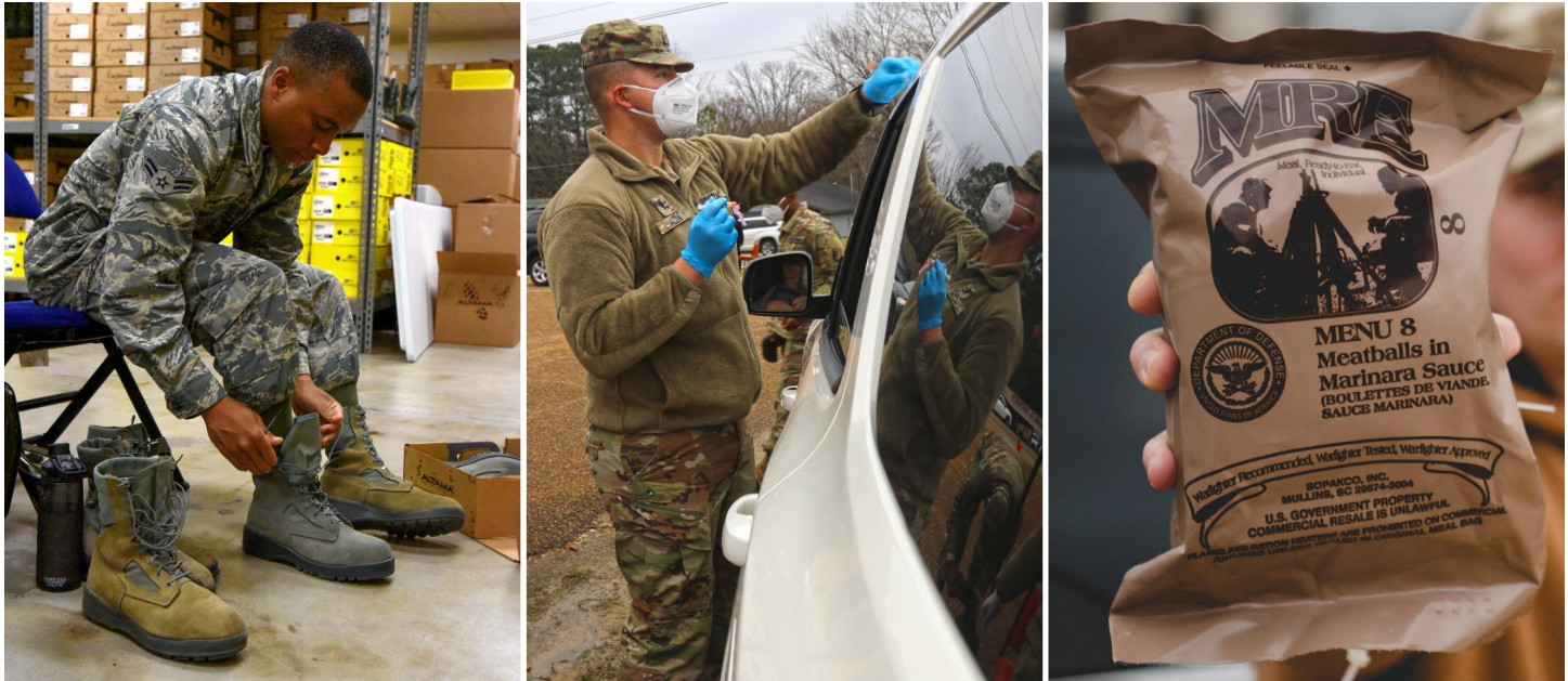
Figure 1: Select Items Covered by the Warstopper Program

GAO-24-106109