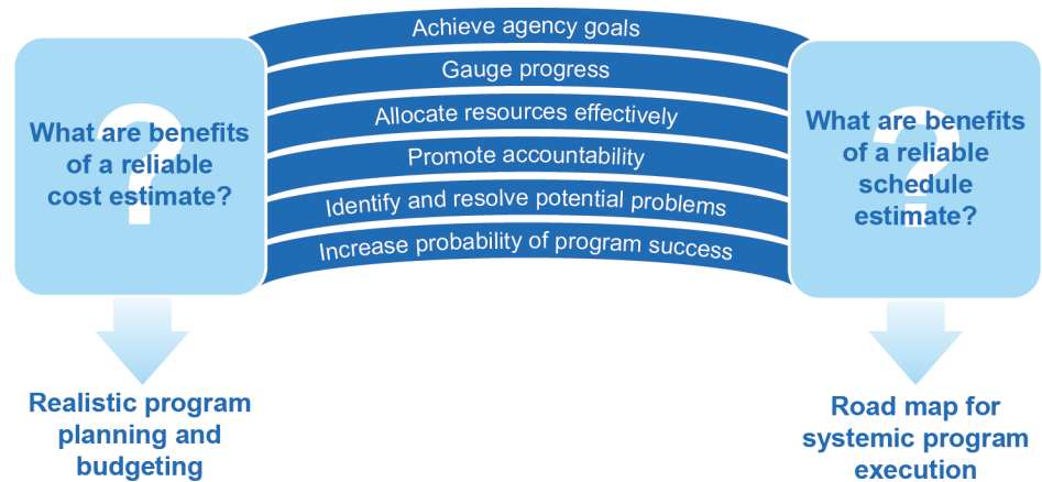
Figure 1: Summary of Shared Benefits of Reliable Cost and Schedule Estimates

Cost and schedule estimates are integrally related. A cost estimate cannot be considered credible if it does not account for the potential cost effects of falling behind schedule. Conversely, a well-planned schedule can help program managers develop reliable time-phased budgets and use funds effectively. Figure 1 provides a summary of the shared benefits of reliable cost and schedule estimates.