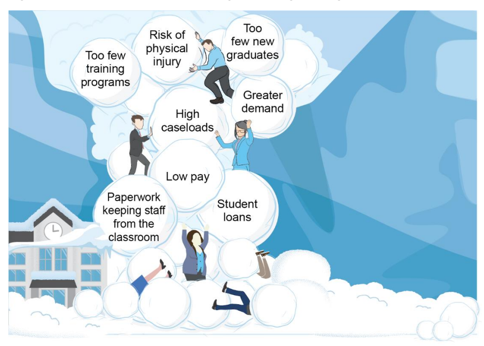
Figure 2: Reported Factors Contributing to Staffing Shortages

Source: GAO analysis of interviews and supporting documentation. GAO (background); stock.adobe.com (icons). | GAO-24-106264