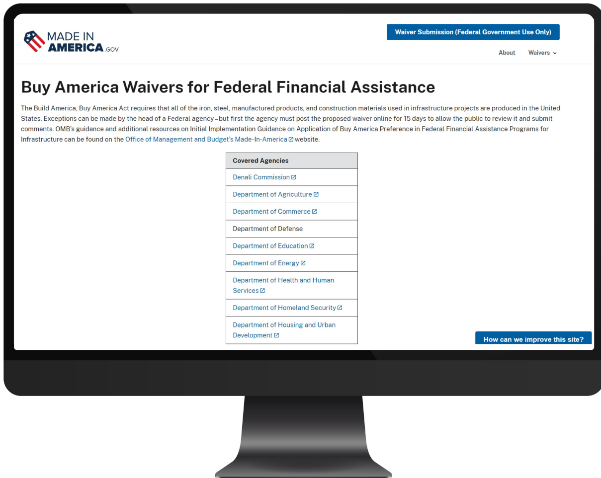
Figure 1: Madeinamerica.gov Webpage Showing Links to Agency Websites

Source: madeinamerica.gov ; lembergvector/stock.adobe.com (icon). | GAO-24-106166