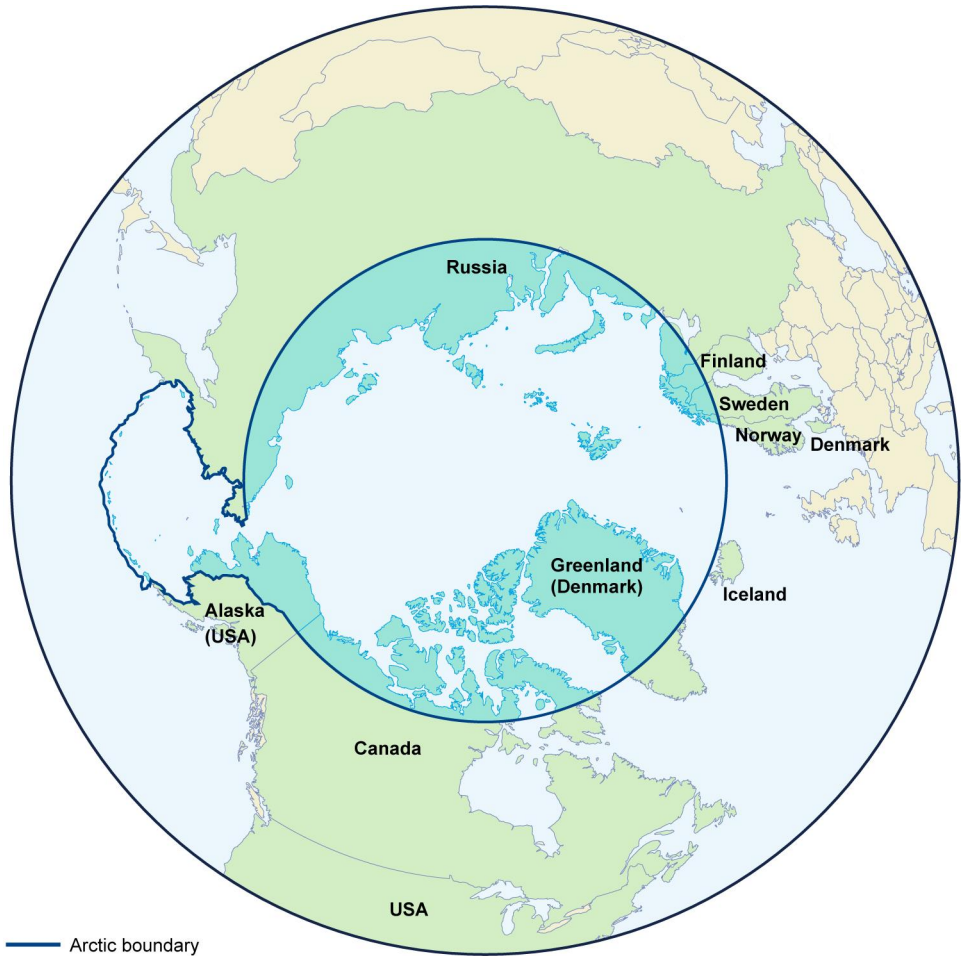
Figure 2: Map of the Arctic Region, as Defined by the Arctic Research and Policy Act a

GAO-23-106002