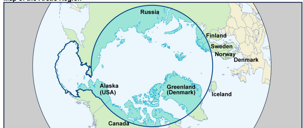
Map of the Arctic Region

Management roles for advancing U.S. Arctic priorities span the federal government. In October 2022, the federal government published an updated Arctic strategy that serves as a framework for guiding its approach to addressing emerging challenges and opportunities in the Arctic. While many federal entities engage with foreign partners on Arctic issues, the Department of State serves as the lead for Arctic diplomacy efforts. The Biden administration announced that an existing Arctic coordinator position at State would be elevated to an Ambassador-at-Large position in August 2022, but the nominee has yet to be confirmed.