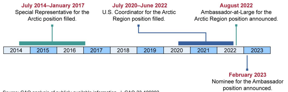
Figure 4: Timeline Showing Different Arctic-related Leadership Positions at State

Source: GAO analysis of publicly available information. | GAO-23-106002