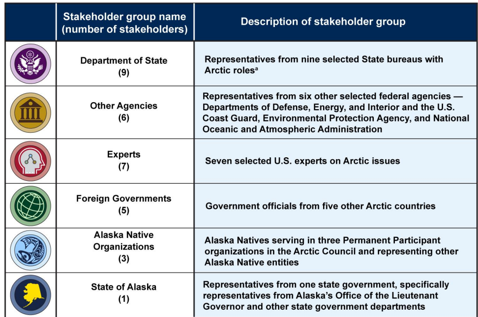
Figure 1: Selected Stakeholder Groups Interviewed for Perspectives on the Federal Government’s Management of U.S. Arctic Priorities

GAO-23-106002