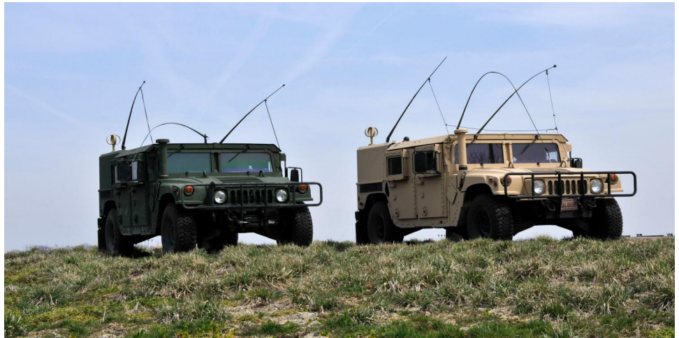
Figure 1: Air Force's High-Mobility Multipurpose Wheeled Vehicles

GAO-22-105251