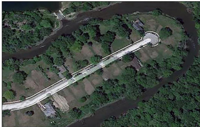
Neighborhood after property acquisitions

The City of Des Plaines received FEMA grants in 2015 and 2019 to acquire and demolish about 25 homes. The city maintains services and utilities for the remaining homes in the neighborhood.