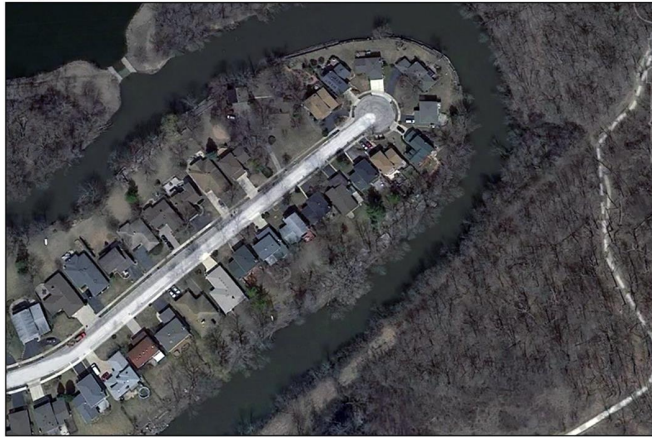
Neighborhood before 2013 flood

A neighborhood in Des Plaines, Illinois, was surrounded on three sides by a river.