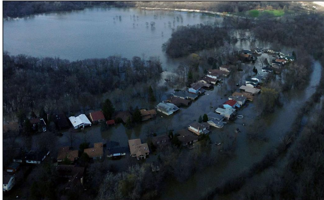
Neighborhood during 2013 flood

In April 2013, the neighborhood suffered severe flooding.