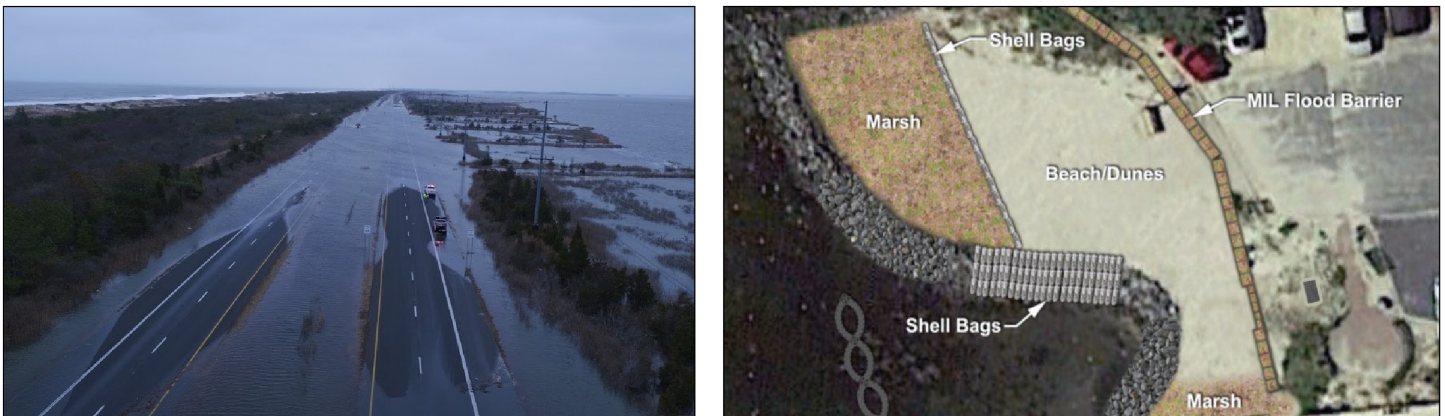
Figure 2: Flooding (Left) and Resilience Enhancements Made (Right) on Delaware State Route 1

Photo is from 2017 and the rendering was published in 2018. | GAO-21-561T