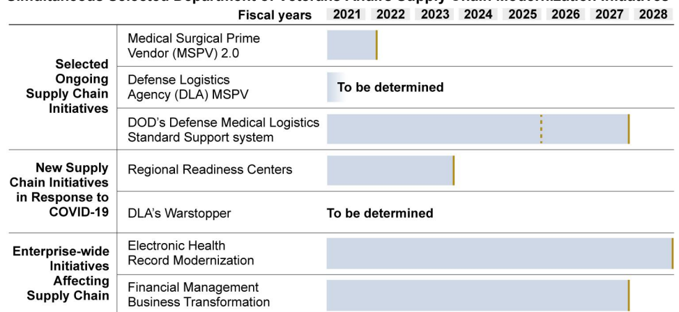
Simultaneous Selected Department of Veterans Affairs Supply Chain Modernization Initiatives

— Planned full implementation date — Potential accelerated full implementation date