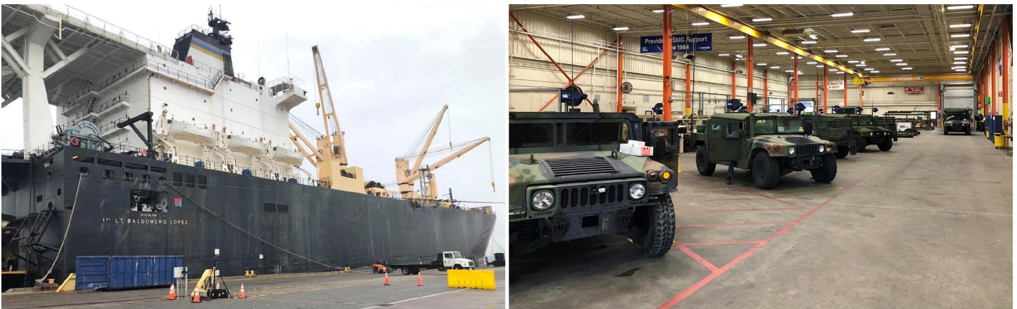
Figure 1: Marine Corps Prepositioning Ship (left) and Vehicles in the Prepositioning Program to Be Maintained (right) at Jacksonville, Florida

Each of the military services operates and manages its respective prepositioning program. Also, each service maintains its own configuration and types of assets to support its program. For example, figure 1 shows a prepositioning ship and vehicles that are part of the Marine Corps' program.