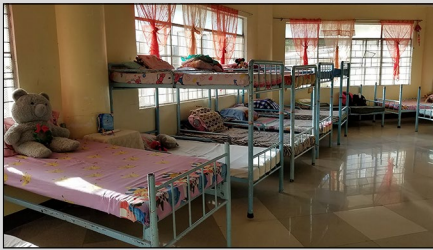
Source: GAO analysis of U.S. Agency for International Development (USAID) documents. | GAO-21-53

Through the Philippines-American Fund as its implementing partner, USAID awarded six grants to combat trafficking in persons in the Philippines. According to USAID, one of the grants supported a local organization operating a shelter for trafficked children in one of the country's known trafficking hotspots. The shelter has supported 70 children since receiving the $440,000 grant in 2014. The photo shows a bedroom for trafficked children.