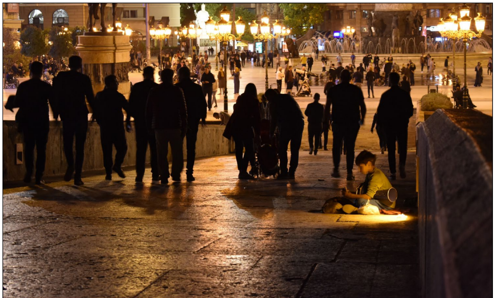
Figure 2: A Child Forced to Beg in a Busy Town Center in North Macedonia, According to State

Source: Department of State, 2020 Trafficking in Persons Report. Photo by Atsuki Takahashi. | GAO-21-53