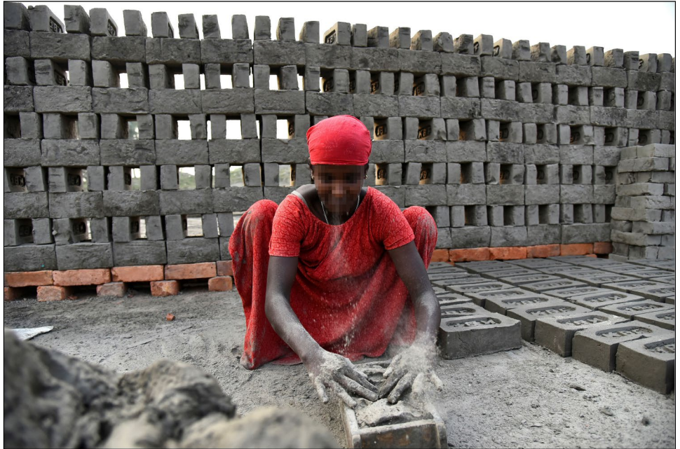
Figure 3: Indian Woman Exploited through Bonded Labor at a Brick Factory in Rural India, According to State

Source: Department of State, 2020 Trafficking in Persons Report. Photo by Reuters. | GAO-21-53