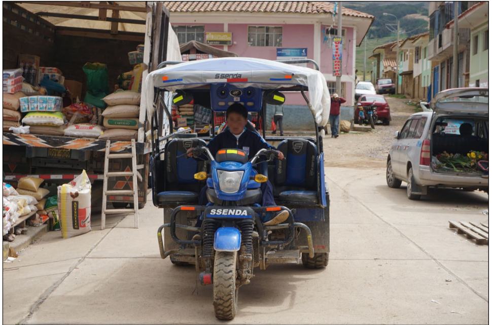
Figure 1: A Boy Drives a Motor Taxi at a Market in Peru, Making Him More Vulnerable to Traffickers, According to State

Source: Department of State, 2020 Trafficking in Persons Report. Photo by Harold Jahnsen. | GAO-21-53