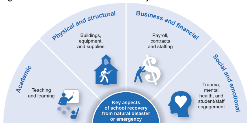
Figure 1: Characteristics of School Recovery from a Natural Disaster or Emergency

Source: GAO analysis of Readiness and Emergency Management for Schools (REMS) Technical Assistance Center Recovery Fact Sheet . | GAO-21-62R