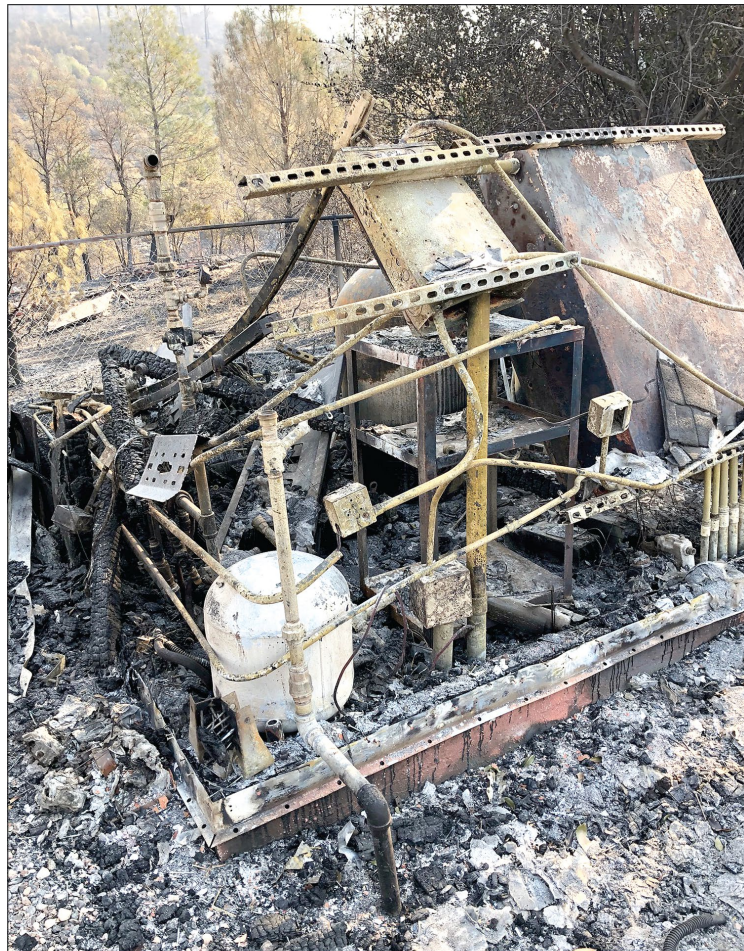
Figure 2. School Water System Damaged by the Camp Fire in 2018

Source: Golden Feather Union Elementary School District. | GAO-21-62R