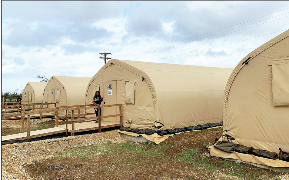
Figure 3. Attending Class in Temporary Tents after Super Typhoon Yutu

GAO-21-62R