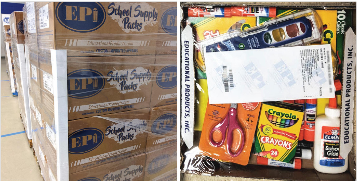
Figure 2: School Supplies Funded by the Johnson-O'Malley Program

support programs providing Native cultural and language enrichment; academic support; dropout prevention; and the purchase of school supplies, according to BIE (see fig. 2). JOM programs, particularly for students who are not living near tribal land, may be the only way students can access tribal language and cultural programs.