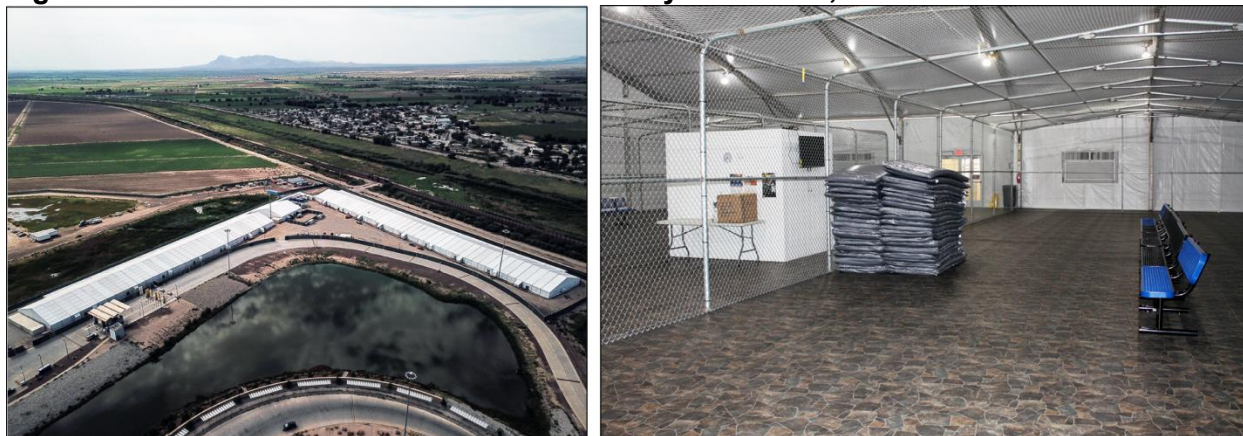
Figure 1: U.S. Border Patrol's Soft-Sided Facility in Tornillo, Texas

GAO-20-321R