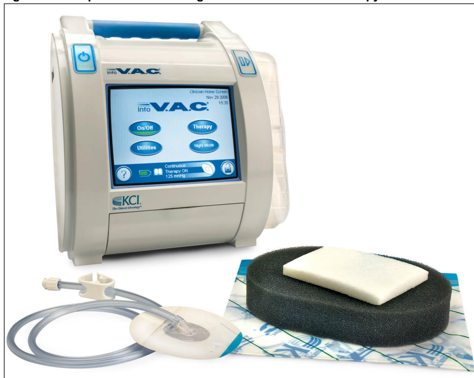
Figure 2: Example of a Durable Negative Pressure Wound Therapy Device

GAO-20-42R