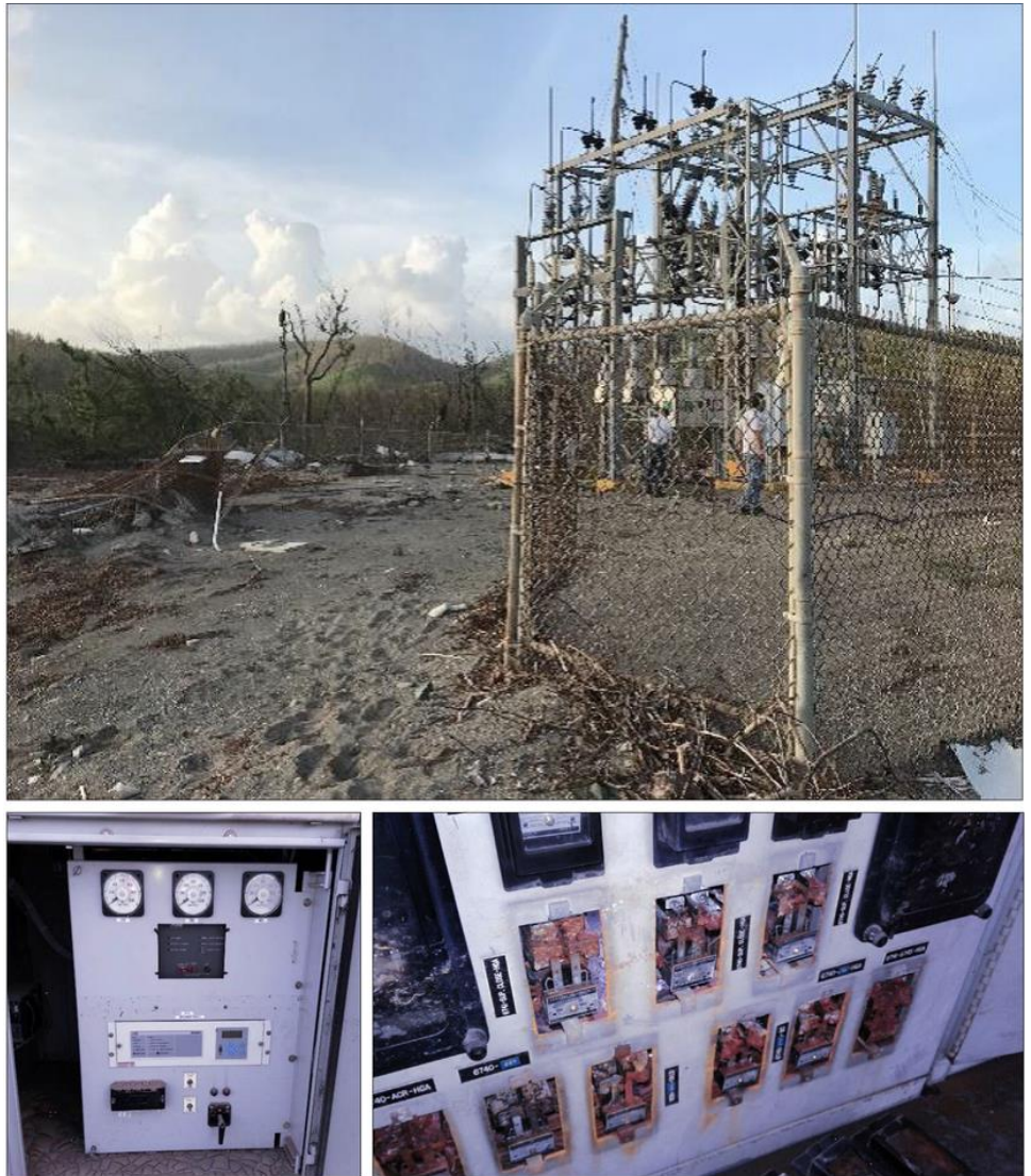
Figure 3: Evidence of Damage and Flooding from Hurricanes Irma and Maria at Critical Substations in Puerto Rico

GAO-20-141