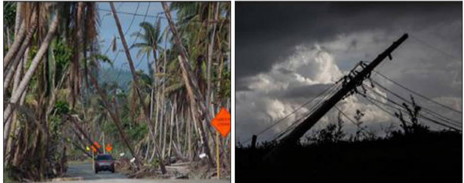
Damaged Power Lines in Puerto Rico in November 2017 after Hurricane Maria

Source: Federal Emergency Management Agency. | GAO-20-141