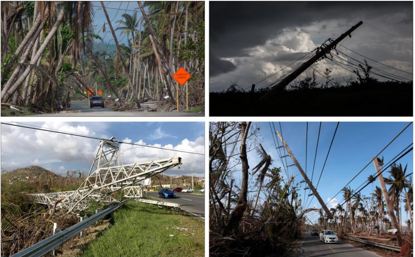
Figure 1. Damaged Power Lines and Electricity Grid Infrastructure in Puerto Rico in November 2017 after Hurricane Maria

GAO-20-141