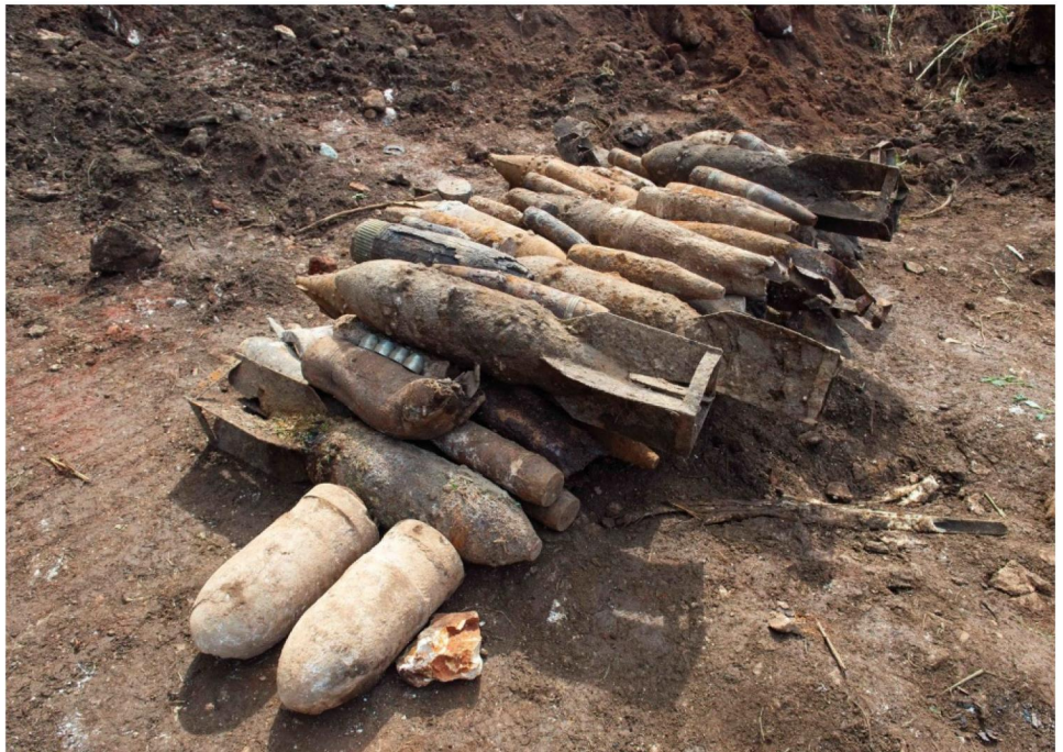
Cache of munitions awaiting disposal.