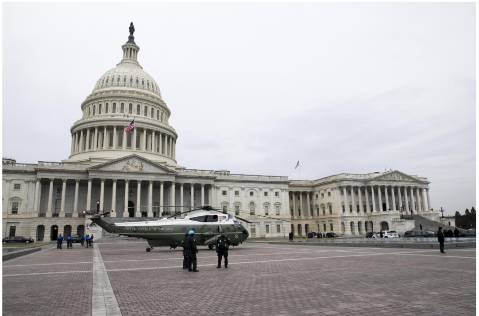
Figure 4: Support to the President