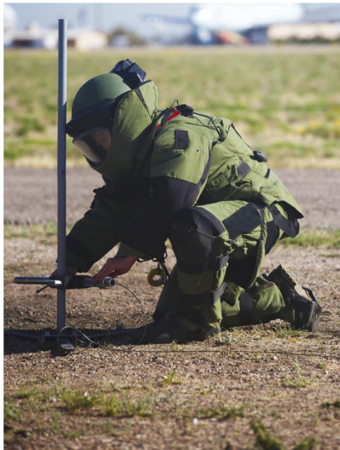
An EOD technician preparing to render safe a practice munition.

GAO-19-698