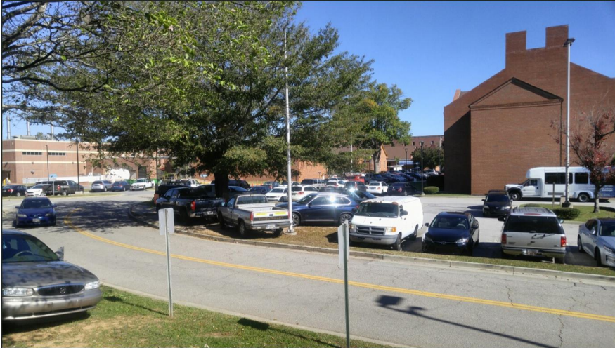
Figure 3: Wm. Jennings Bryan VA Medical Center's Current Parking Situation

Wm. Jennings Bryan VA Medical Center, Columbia, SC