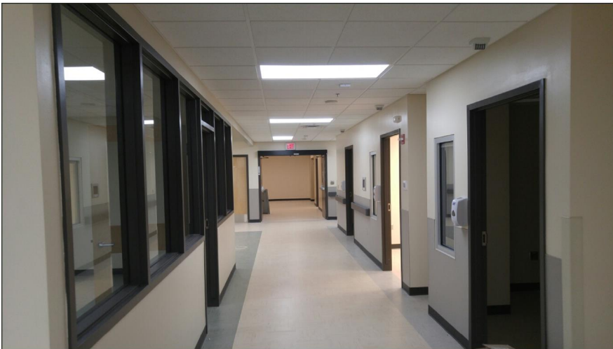
Figure 6: Iowa City Patient-Aligned-Care Team Addition

Project summary: The project will construct a new physical plant. The new plant will house four new boilers and an emergency diesel engine generator that will replace the current boiler plant that is 95 years old and does not meet VA security set-back requirements. The current physical plant flooded in 2010, which interrupted operations for several days and is still susceptible to flooding.