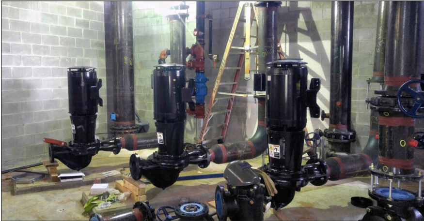
Figure 4: Carl Vinson VA Medical Center's Boiler Plant Addition