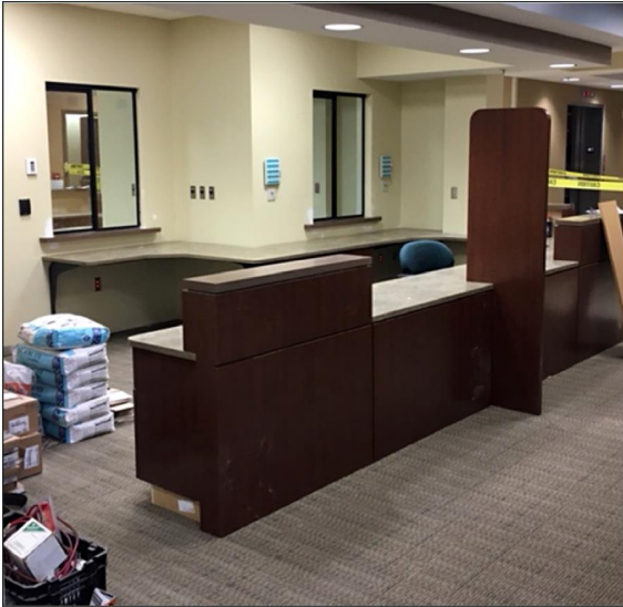
Figure 9: Walla Walla's Specialty Clinic Facility