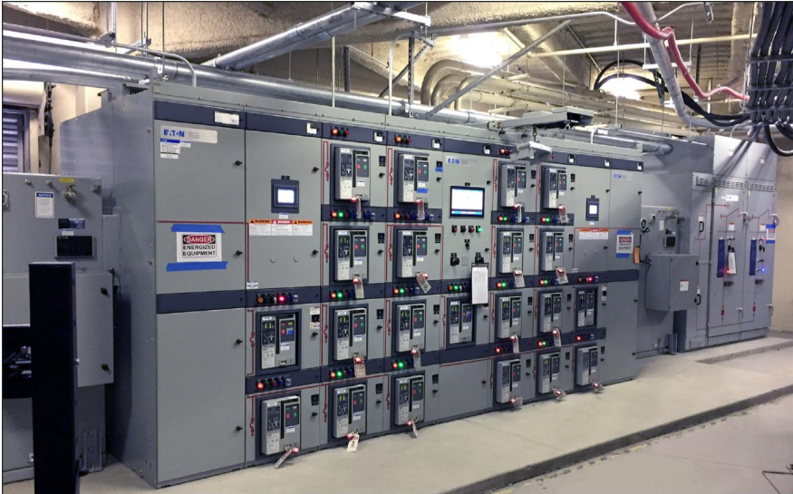
Figure 8: Seattle Electrical Upgrade

GAO-18-479