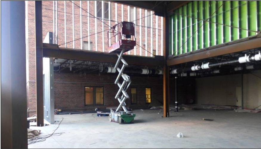
Figure 7: Kansas City Veterans' Service Center Addition