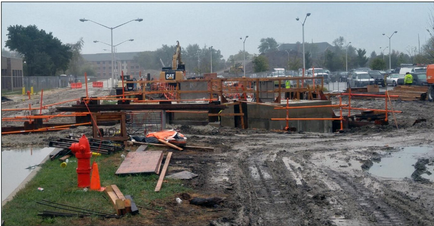
Figure 5: Hines Boiler Plant Project in Construction