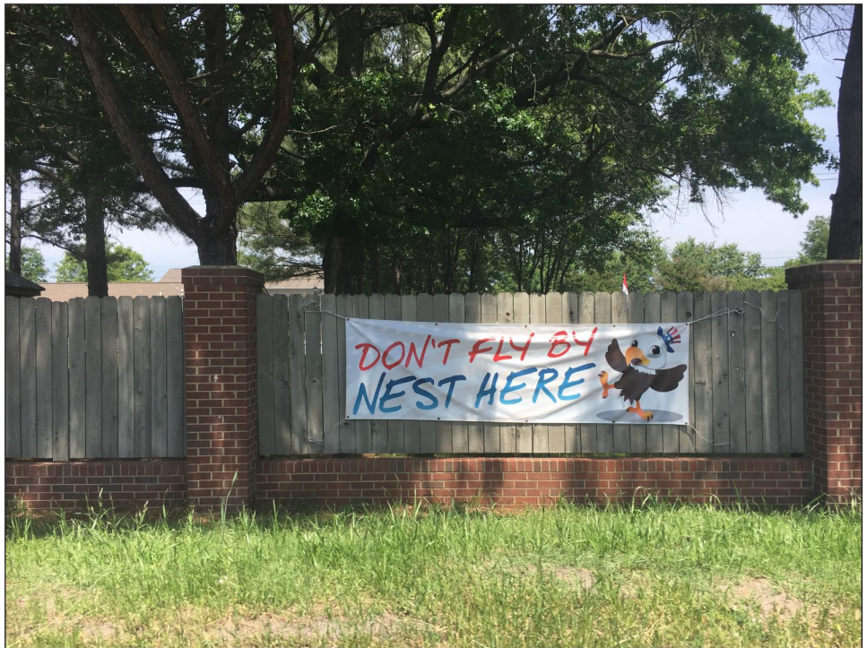
Figure 2: Advertisement Seeking Tenants for Privatized Housing