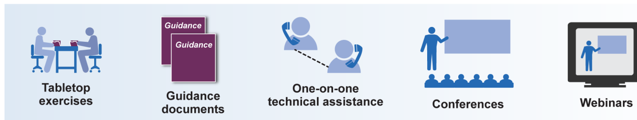
Figure 2: Types of Federal Emergency Preparedness Resources for Colleges

Source: GAO analysis of federal written responses, agency interviews, and agency websites. | GAO-18-233