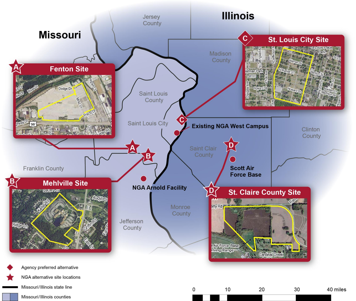
Figure 1: Geographic Locations of the Four Final Site Alternatives for the New National Geospatial-Intelligence Agency (NGA) West

Source: NGA and U.S. Army Corps of Engineers data. | GAO-17-643