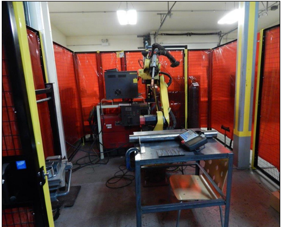
Figure 4: Welding Machine Used For Training

In order to accommodate increasingly automated technologies in manufacturing, the Jane Addams Resource Corporation acquired this robotic welder, which can be programmed to handle parts and weld. This welding machine is used to teach welding techniques to students in JARC's training program.