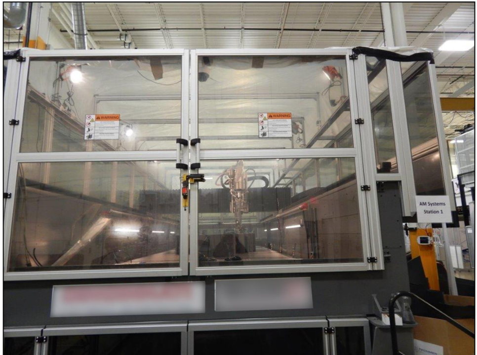
Figure 3: 3D Printer Used in Advanced Manufacturing

This 3D printer is housed at the Department of Energy's Manufacturing Demonstration Facility at the Oak Ridge National Laboratory, which partners with the Manufacturing USA Advanced Composites Manufacturing Innovation institute in Knoxville, TN.