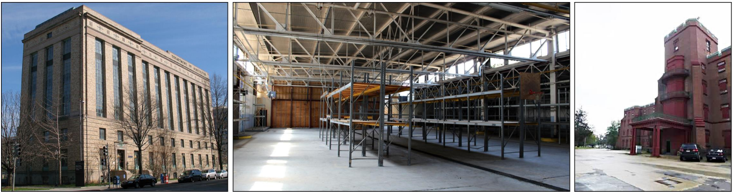
Figure 1: Examples of Vacant Federally Owned Buildings and Warehouses in Washington, D.C.

dollars annually to operate and maintain. Federally owned buildings range from multi-story buildings located in urban centers to remotely located storage facilities in national parks or national forests. Federally owned buildings are used for offices, warehouses, schools, hospitals, housing, data centers, and laboratories, among others uses. Our prior work has found that when these types of buildings remain vacant, they may be good candidates for disposal or re-use for another agency (see fig. 1).