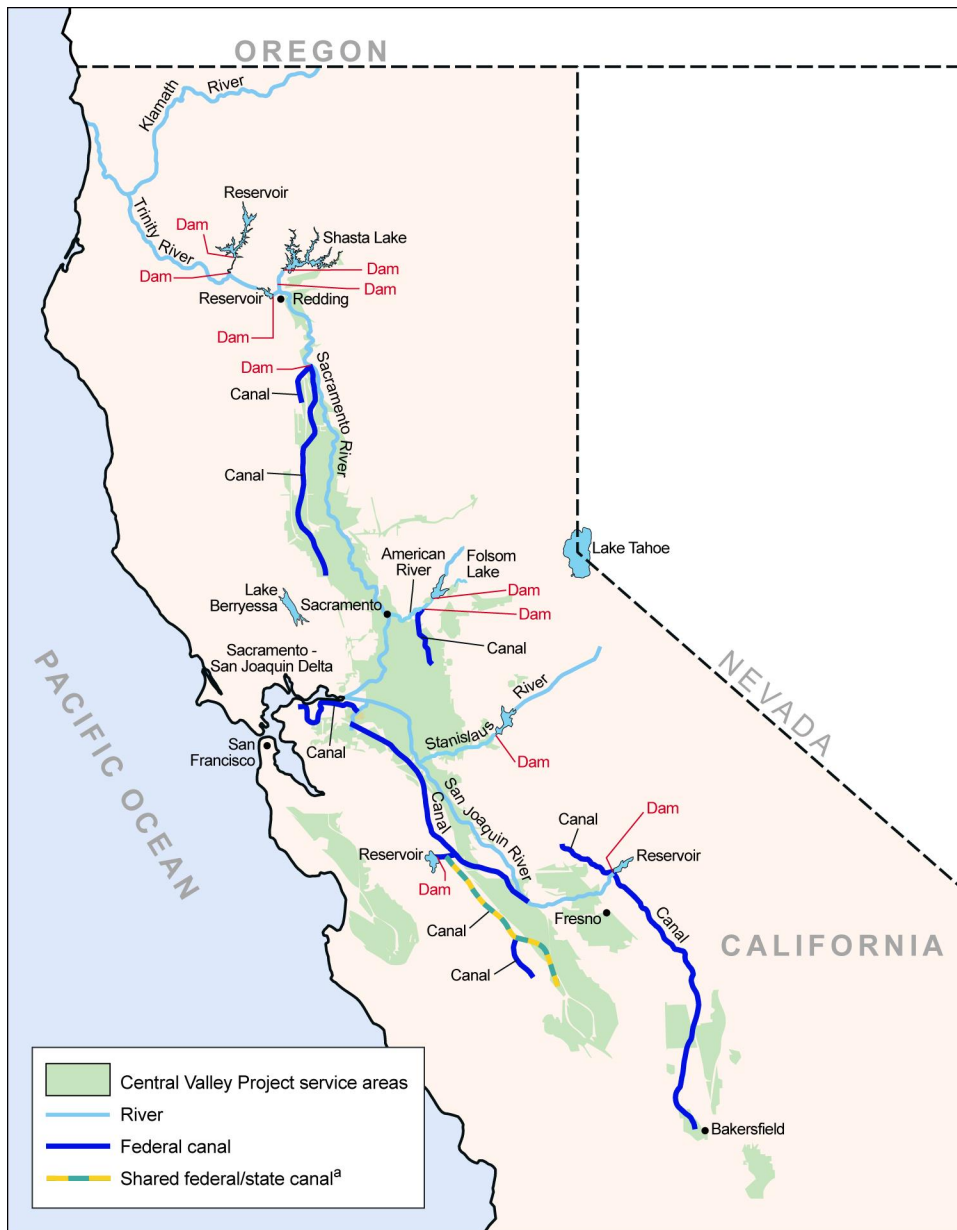
Figure 1. The Central Valley Project in California

GAO-15-468R